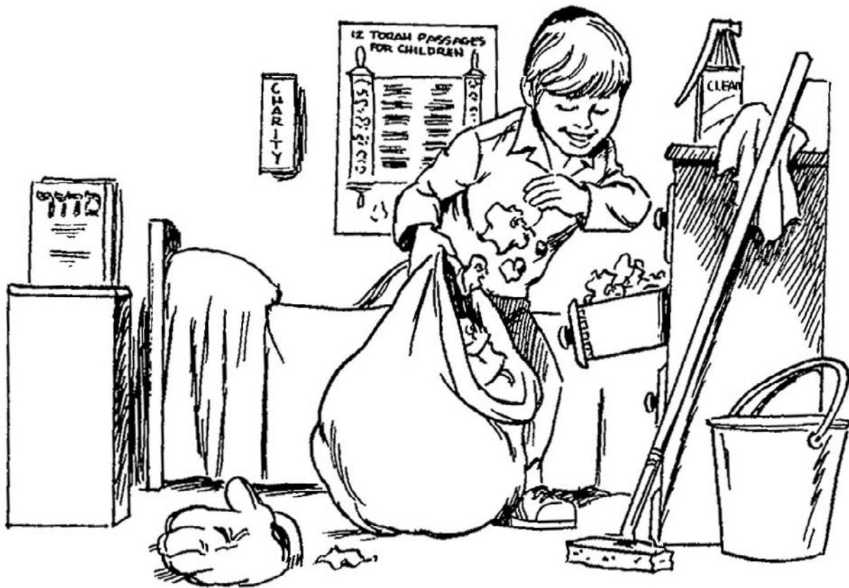
Cleaning the House for Passover