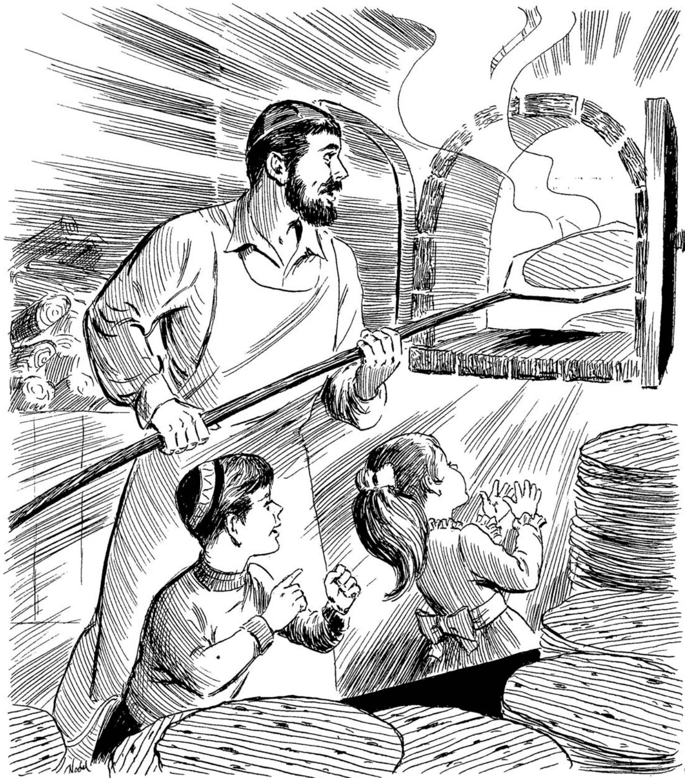
Baking the hand-made Shmurah Matzah