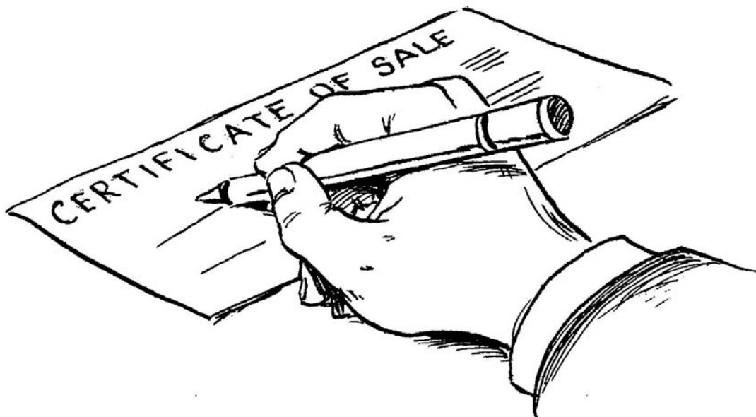
Signing the Certificate Authorizing the Sale of Chametz